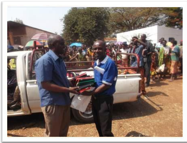
Relief Aid - food and Bibles for Burundian refugees