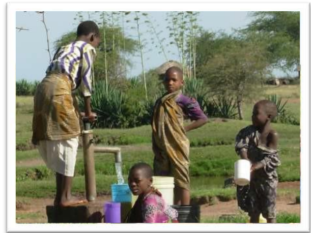
Women at a BWM water well

Help support Barry Wood Ministries in growing our organization by joining us for our annual Golf Scramble. All proceeds from the tournament will go to support the foundation in: