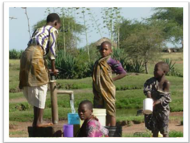
Women at a BWM water well

Help support Barry Wood Ministries in growing our organization by joining us for our annual Golf Scramble. All proceeds from the tournament will go to support the foundation in: