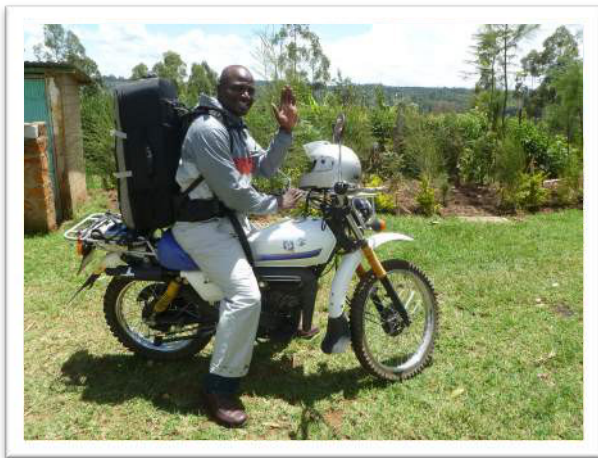
BWM staff heading to the bush with Jesus film